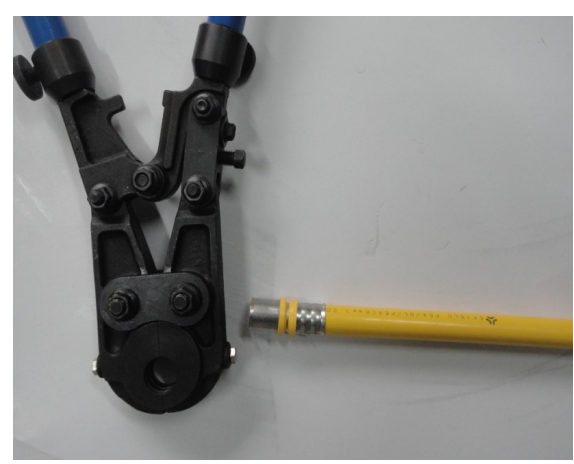
6, Open the handles, remove the clamping tool from the fitting and installation is finished.